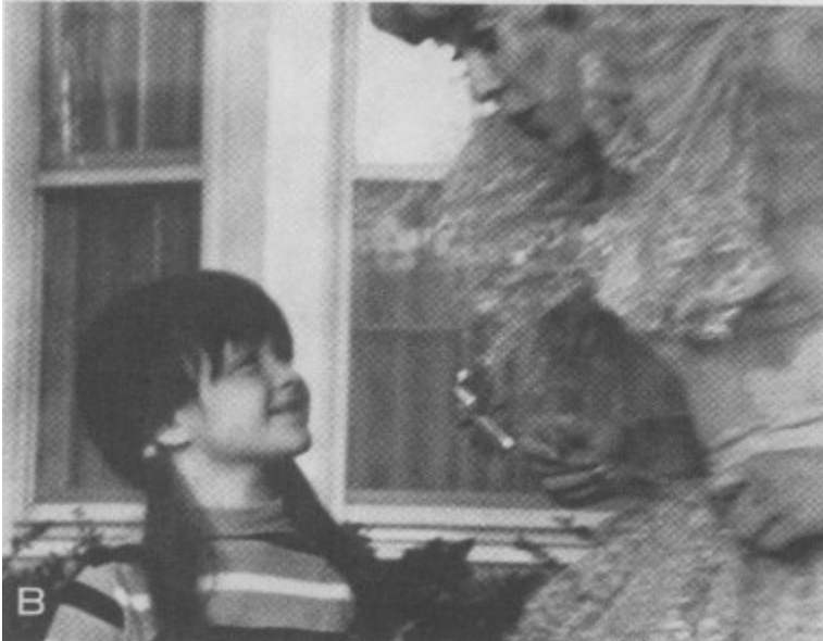
Figure 11-1 The Wicked Car Witch and the Good Car Fairy

And they were placed on shows with relevant themes, in contrast to many public service ads shown at daybreak or just before sign-off, or during some unpopular show. The father-son ad was shown during NFL games on Sunday afternoon. The scarred women were shown on soap operas. The children's ads popped up frequently on popular children's shows. An ad featuring a nurse and a doctor talking about an injured patient that was not belted was shown on prime-time medical drama shows popular at the time. When one of our ads was on the designated cable, an ad for a product being tested was shown on the other cable. Based on ratings of the audience of the programs on which the messages were shown we estimated that the average television viewer saw one or another of the